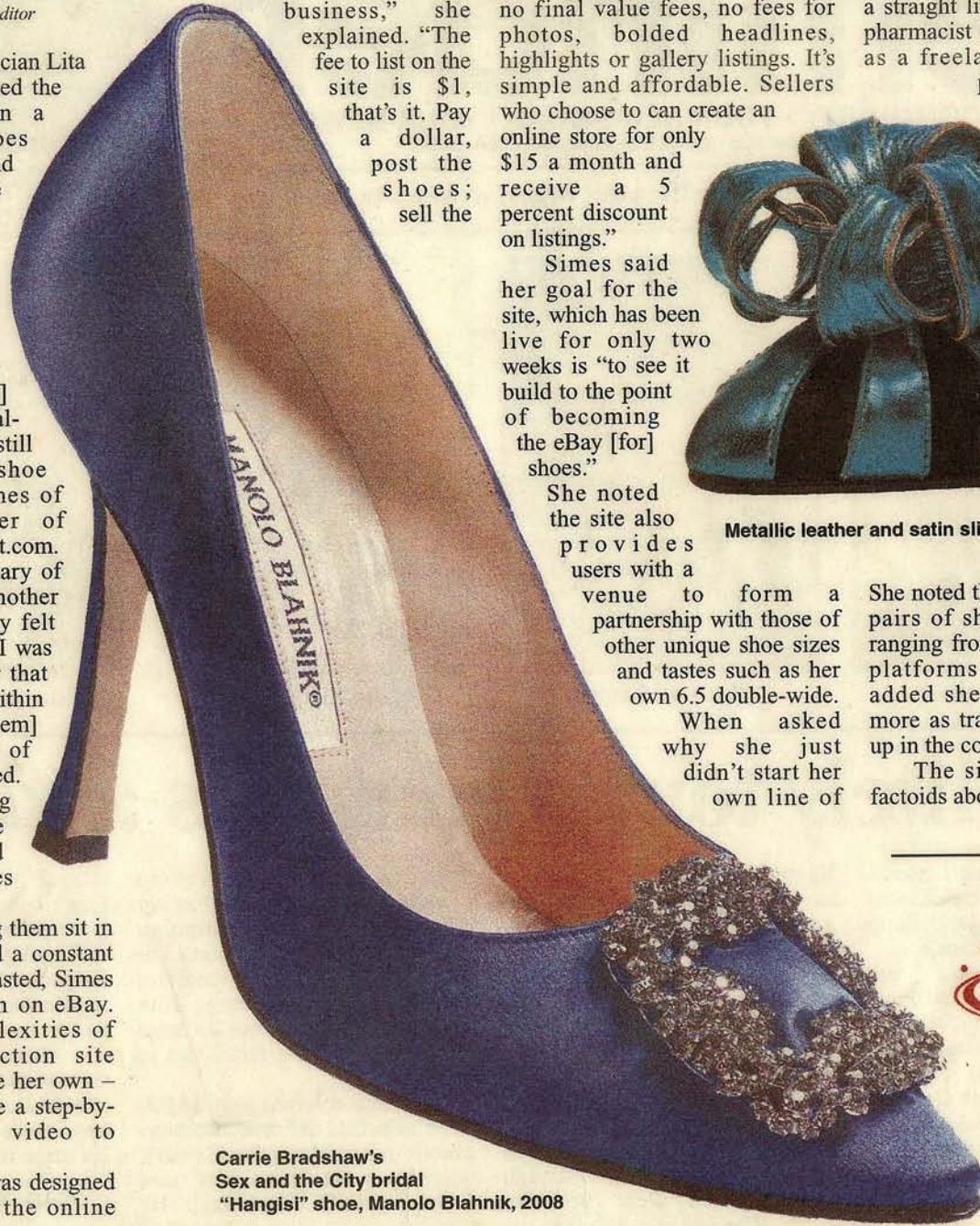
Carrie Bradshaw's Sex and the City bridal "Hangisi" shoe, Manolo Blahnik, 2008